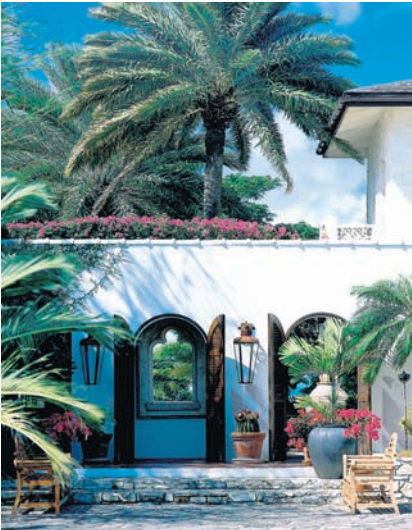
The Jumby Bay resort in Antigua