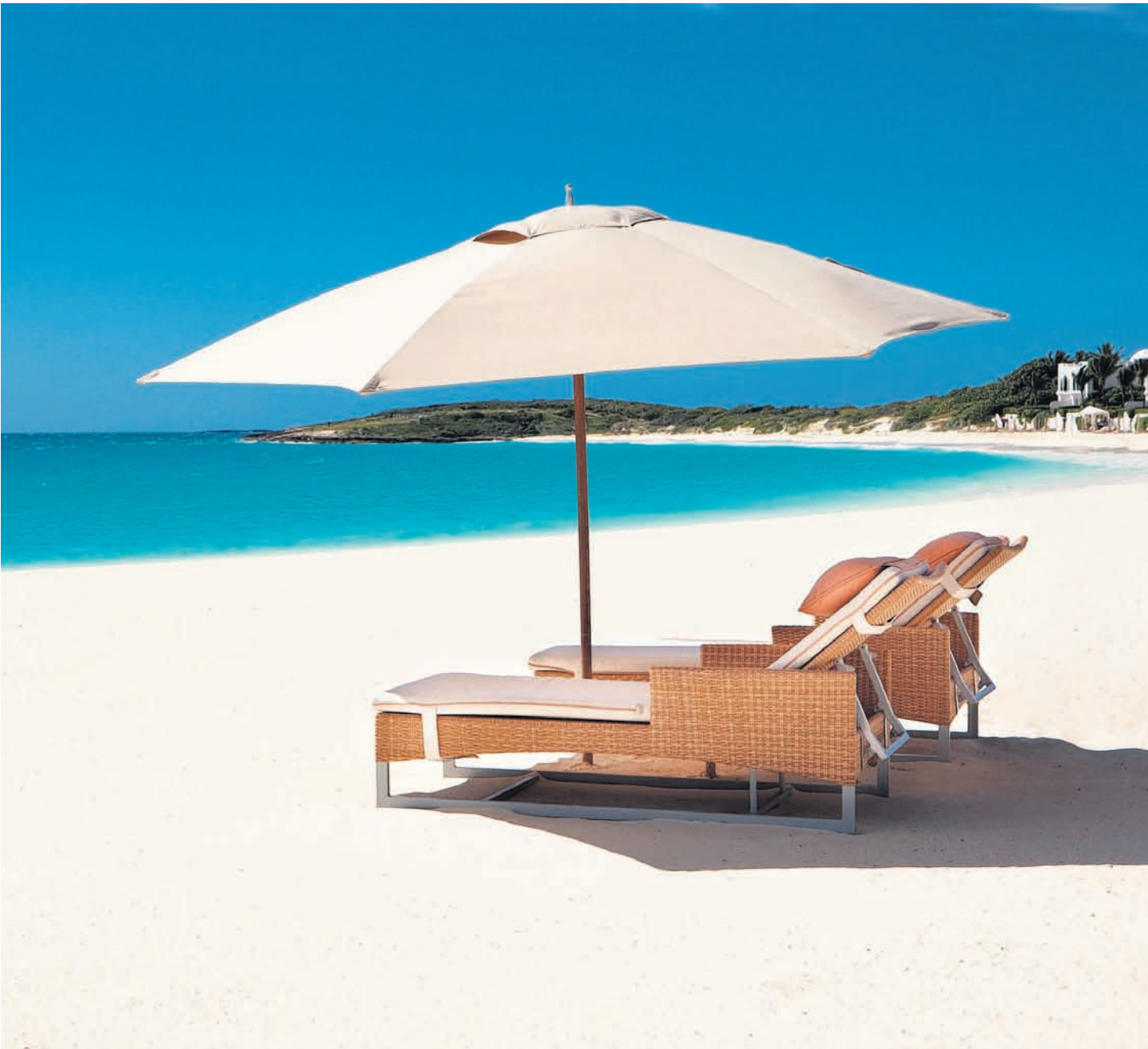
Anguilla is home to 33 white sand beaches, including this one at Cap Juluca.

This goes beyond tiny soaps and shampoo bottles. Thirty-five percent of global travelers say they make off with hotel amenities, such as towels, lamps, robes and bedding, according to a recent survey by the hotel booking site Hotels.com. Also, Danish travelers are the least likely to pocket hotel property (88 percent said they had never taken hotel property); Colombian travelers came in at the bottom of the ranking (43 percent), according to the survey of 8,600 travelers from 28 countries and cities. Sixty-six percent of Americans surveyed said they stole hotel property, and when they did, it was linens and towels, the survey said. - Los Angeles Times via MCT