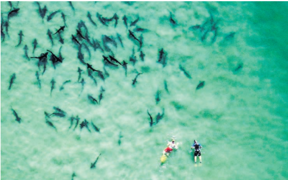
Peak leopard shark viewing is between August and September.

The leopard sharks come close to shore from June to early December, peaking between August and September, when hundreds congregate along a small stretch of