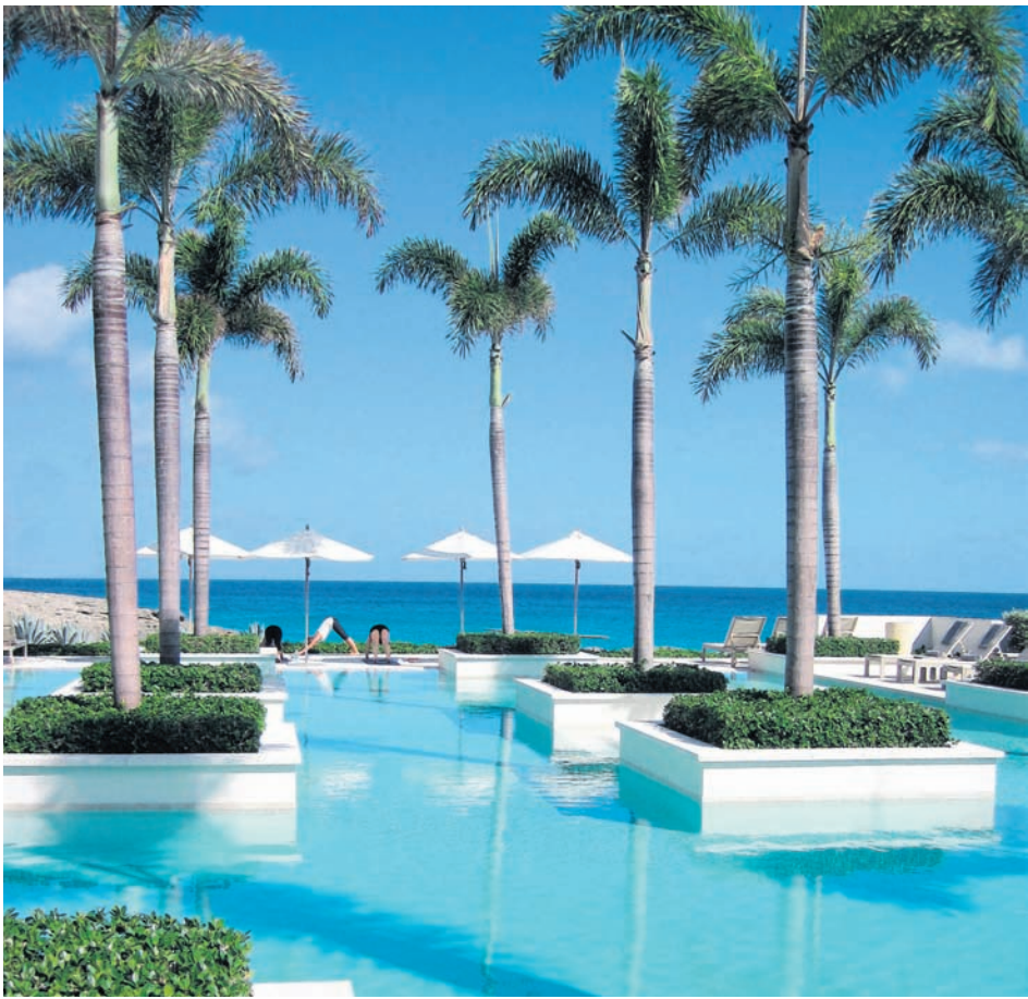
Guests at the Viceroy hotel can begin the day with a yoga class overlooking the Caribbean.

Blanchards reopened and has become an island institution, hailed as one of the Caribbean's best res-