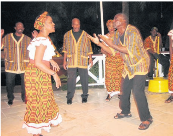
A Mayoumba folklore troupe performs at Anacaona Hotel's Firefly Restaurant.