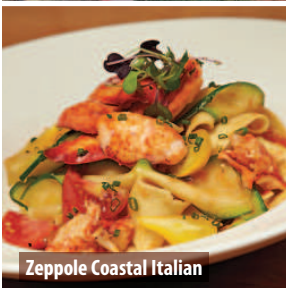
Zeppole Coastal Italian