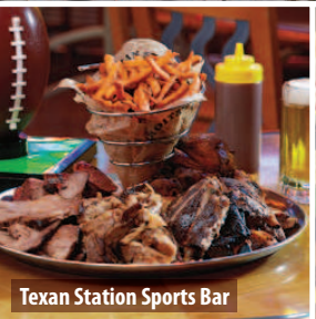
Texan Station Sports Bar