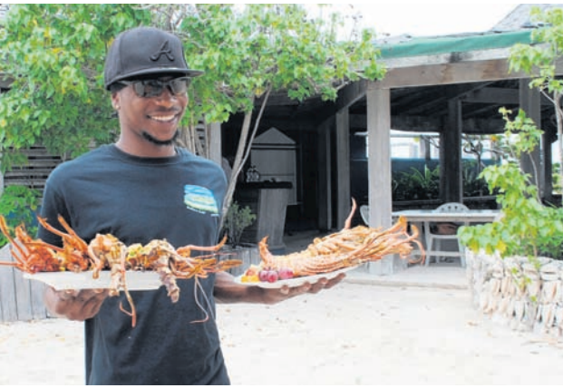
Shellfish lovers flock to Scilly Cay island restaurant for grilled lobster and Anguillian crayfish.

Nightlife on Anguilla, albeit a bit subdued, isn't nonexistent; you just have to know where to find your musical match. Lovers of reggae music will want to spend an evening at the Dune Preserve restaurant and beach bar, situated on Rendezvous Bay near the