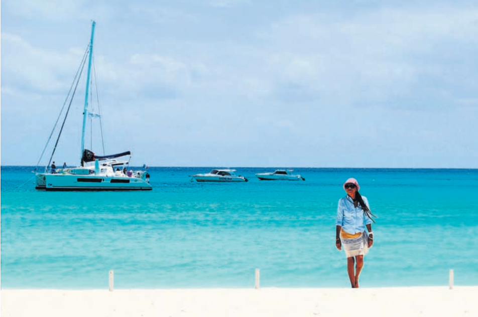
Cove Bay's beach is uncrowded, and its waters are clear and calm.