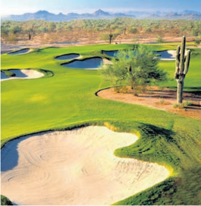
The course at Phoenix's Wildfire Golf Club

If your family is thinking more along the lines of a quick, fun getaway before school starts, check out the Omni Barton Creek Resort & Spa, set in the hills of west Austin and only about a three-hour drive from Fort Worth. The resort is offering special rates for families who golf together, as well as a "Sunny Side Up" package with a rate of $199 per night for a family of four, including daily breakfasts and milk and cookies. Mom and Dad won't get left out; the resort has on-site fitness classes and specials on spa services, including facials and massages, too. For more information, call 866-572-7369 or visit www.bartoncreek.com .