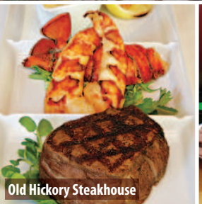
Old Hickory Steakhouse