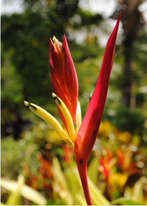
Tropical flowers cover Galley Bay's 40-acre property.

Robin Leach, former host of Lifestyles of the Rich and Famous , is among the celebrity owners of Long Island's multimillion-dollar homes. The rest of the private island is shared with the paparazzi-free