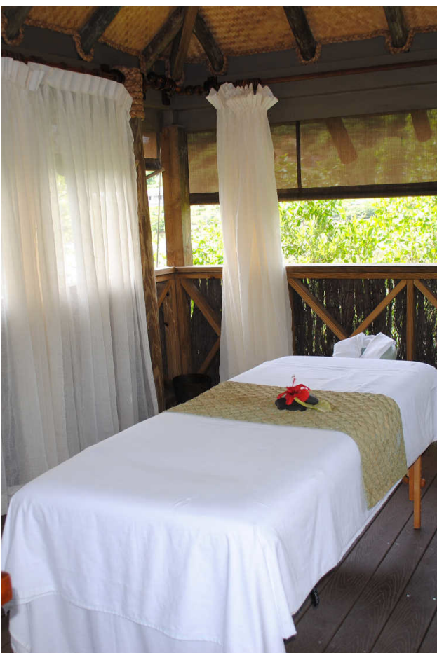
A treehouse in the midst of a bird sanctuary is the setting for a stress-relieving massage at Galley Bay's Indulge spa.

If you need a break from the sun, take a taxi tour of Antigua's landmarks. It's a great way to see more of Antigua's most popular beaches, do a little shop-