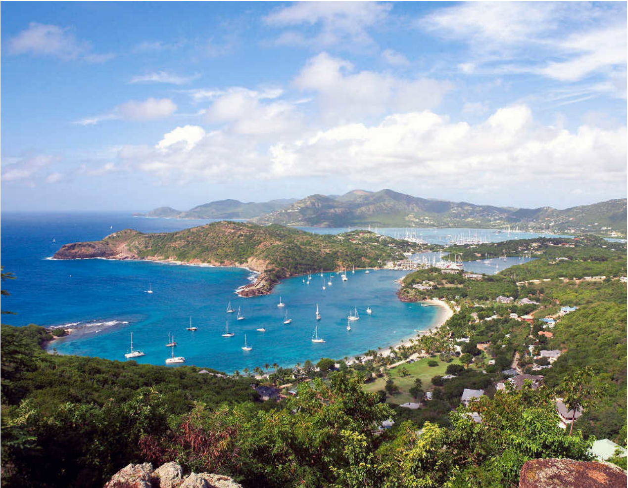
Take in Antigua's best panoramic views of English and Falmouth harbors from Shirley Heights, a restored military lookout on the island's southeastern coast.