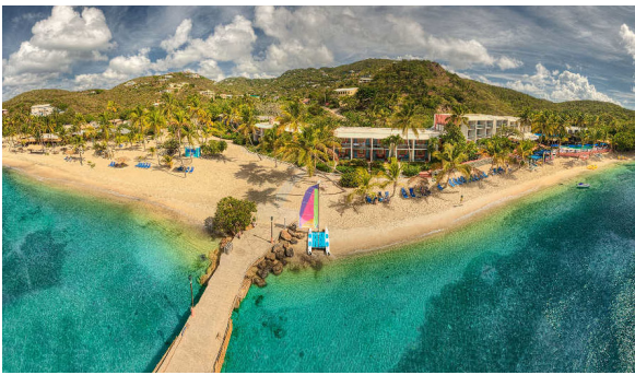
Bolongo Bay Beach Resort Bolongo Bay Beach Resort/Gary Felton