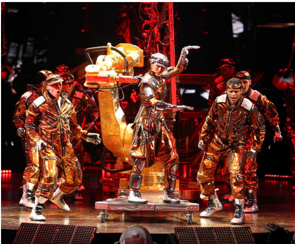
Cirque du Soleil's new Michael Jackson-themed show

Fans of Texas Christian University's men's basketball team can get discounts when they head to the U.S. Virgin Islands for the annual NCAA Paradise Jam tournament, hosted by the University of the Virgin Islands. Here's the deal: The family-owned Bolongo Bay Beach Resort is offering 20 percent off ocean-view and beach-front room rates during the tournament, Nov. 18-21. With the discount, room rates start at $224 per night for two people staying in an ocean-view room, plus tax and service charges. The rates include gear for nonmotorized sports, such as Hobie Cat sailing, windsurfing and snorkeling, as well as a complimentary "discover scuba diving" in-pool lesson. For reservations, call 800-524-4746 or visit www.bolongobay.com . For more information about the tournament, visit www.paradisejam.com .