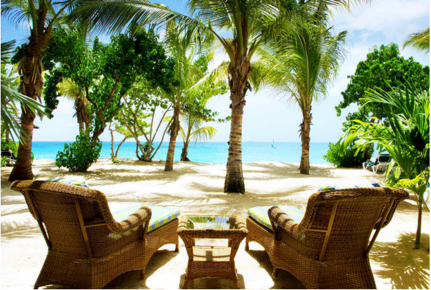
Beachfront rooms at the couples-only Galley Bay open directly onto a perfect stretch of pale sand facing the Caribbean. Elite Island Resorts

ber of others that vary in ambience and amenities. During my time on this largest of the British Leeward Islands, I stayed at two of three Elite Island Resorts-affiliated properties (St. James's Club, Galley Bay and The Verandah), each of which caters to a slightly different clientele and is located on different sides of the island's 108 square miles.