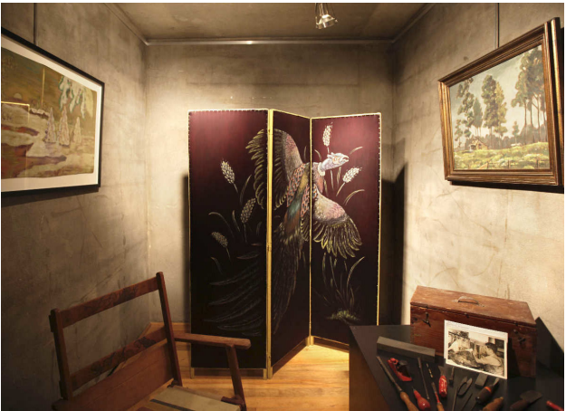
Artwork created by Japanese-Americans at the camp and tools that they used are part of the exhibit.

People entering the gallery space first see photographs of the camp, including murals depicting camp life that were painted