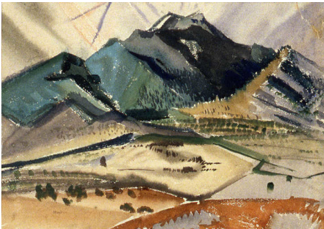
New Mexico Mountain Landscape, Taos

— Carol Sottili and Andrea Sachs, The Washington Post