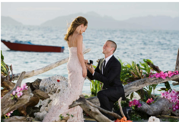
Vomo was the setting of the season finale of The Bachelorette .

On Vomo, I take getting away from it all to the next level, arranging a picnic and snorkeling trip with my pals to explore the vibrant, healthy reefs just off the private island resort’s even more private island — Vomo Lai Lai, a five-minute motorboat ride away. Another day, I go stand-up paddleboarding on the calm, nontidal waters surrounding Vomo. Vomo’s beautifully manicured nine-hole, par-3 golf course is just a walk-by for me, on the way to Senakai Spa, where I indulge in an anti-aging papaya facial. Those who are ready to slow things way down can stake claim to one of the strategically placed hammocks near each villa. I keep eyeing mine and fi-