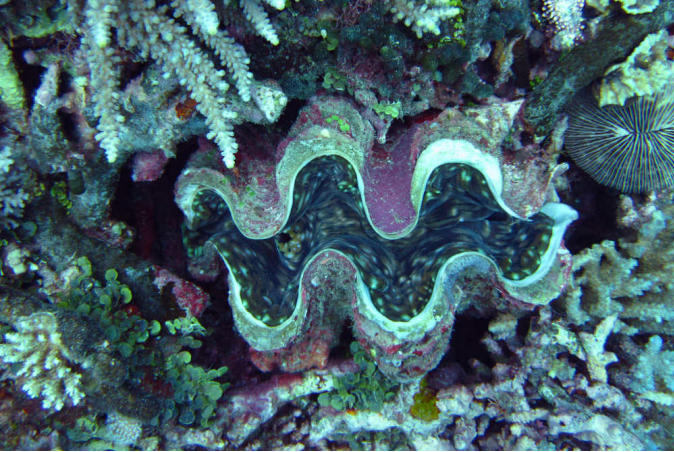
A giant clam rests on a colorful reef in the Koro Sea.

■ The process can take years and requires lots of careful tending.