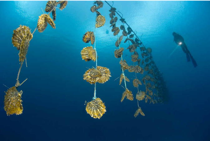
Fishing line is strung through the oysters and tied to ropes that are then lowered into the water.