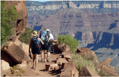
Hikers in Grand Canyon National Park

Are you a fan of spring training’s Cactus League? Just down the road from Surprise, Ariz., and the Texas Rangers, the W Scottsdale is offering a spring training package with accommodations for two, starting at $329 per night, through March 31. The package includes vouchers for two cocktails each night; buy-one-get-one-free ticket deals; and complimentary transportation to Scottsdale Stadium, pre-season home of the San Francisco Giants. Want to see the Rangers play while you’re in Scottsdale? They play the Arizona Diamondbacks on Tuesday and the Colorado Rockies on March 30. Both games are at Salt River Fields at Talking Stick in Scottsdale. 877-782-0104; www.wscottsdalehotel.com/ArizonaSpringTraining