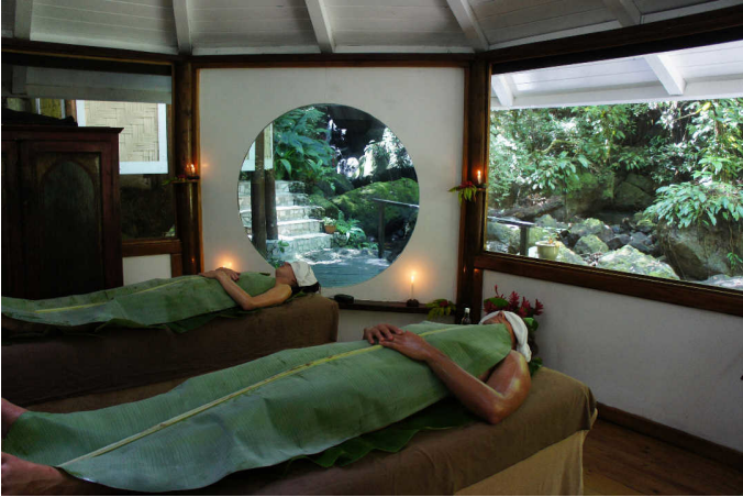
Koro Sun’s visitors can get a banana leaf body wrap. Koro Sun Resort

My luxury lodging at Namale. More on FIJI, 12E