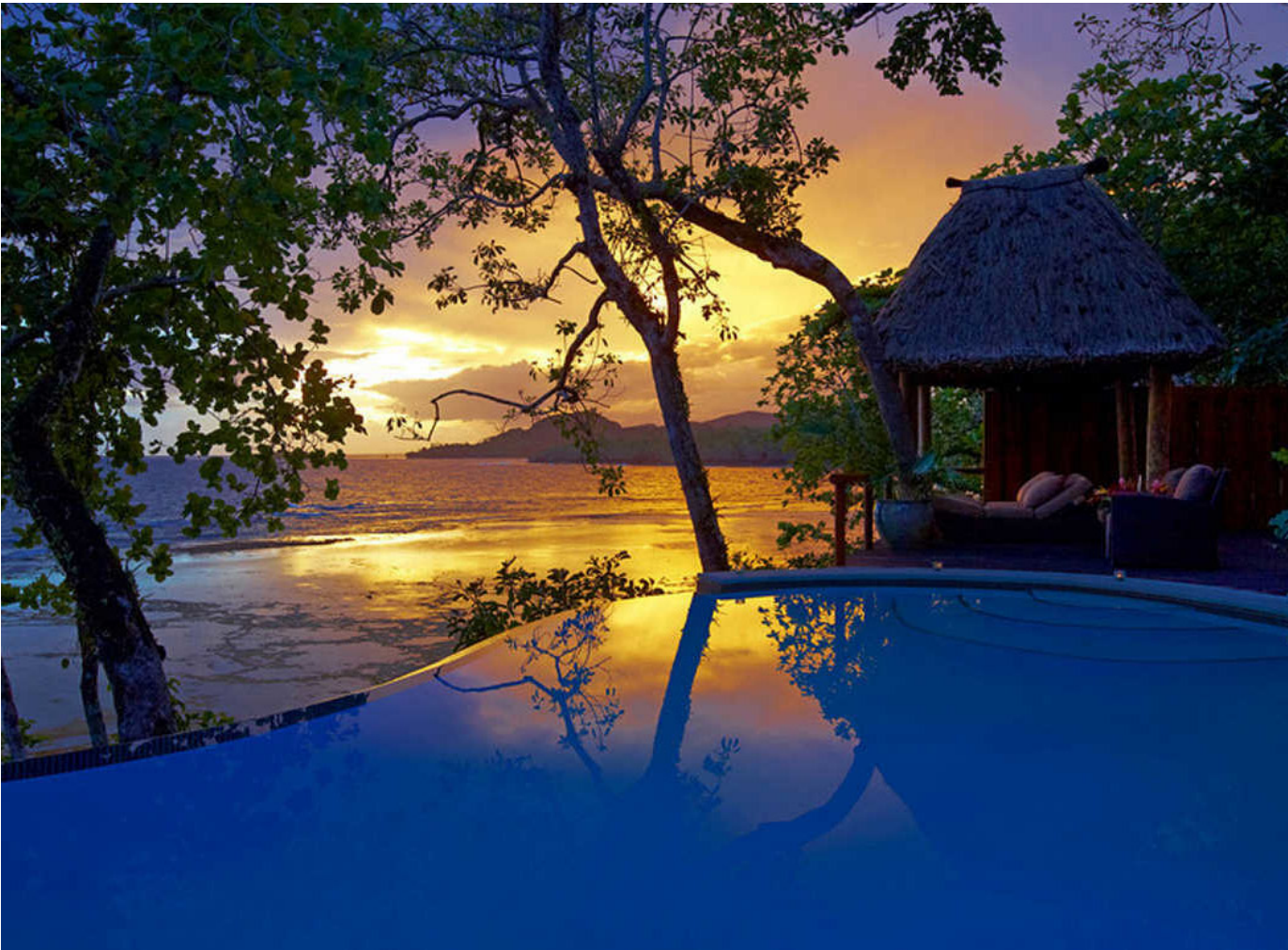
Duavata Villa has hosted Donna Karan, Meg Ryan and other celebrities, as well as serving as the Fantasy Suite on The Bachelorette.

A traveler visits beautiful resorts featured on ‘The Bachelorette,’ and finds that there’s plenty to love