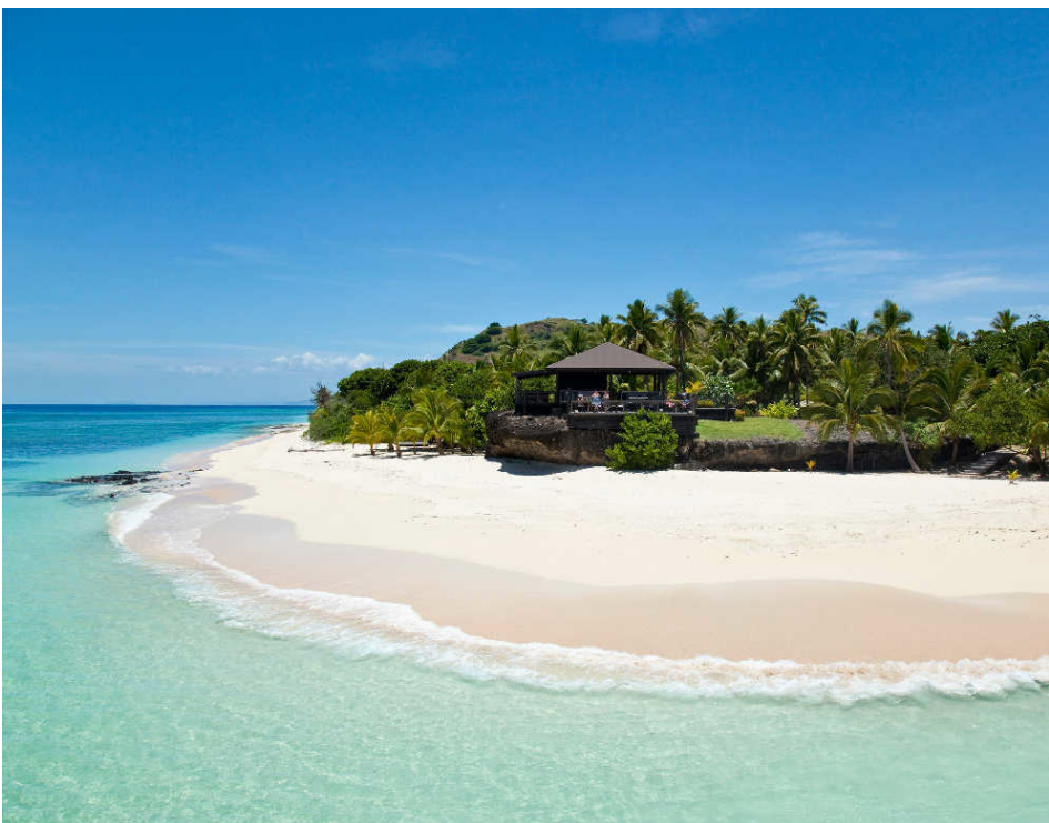
Vomo Island Resort, a private getaway in the Mamanucas chain, is an hourlong boat ride away from Port Denarau Marina.