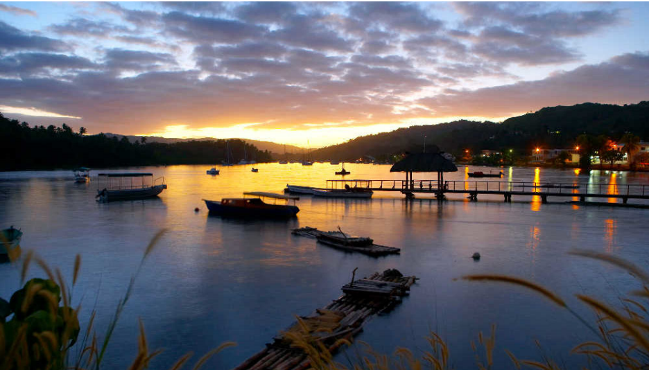
Nutrients found in the largely pollution-free waters of Savusavu Bay provide the ideal environment for culturing pearls.