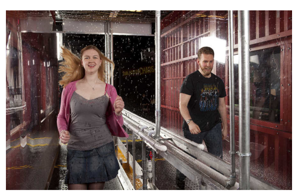
"Running in the Rain" is part of "MythBusters: The Explosive Museum of Science and Industry