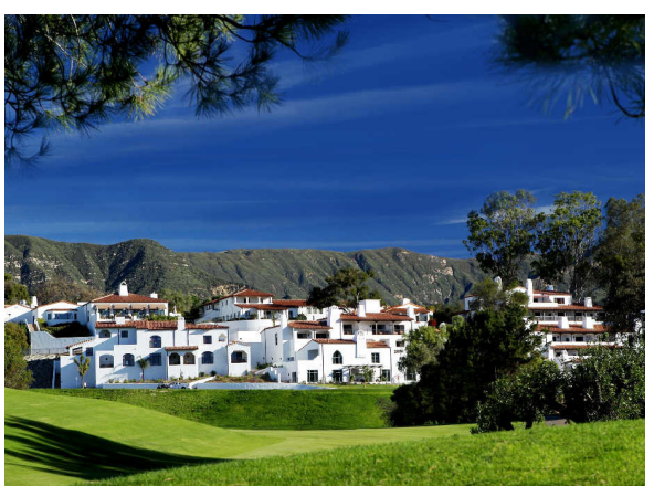
Ojai Valley Inn & Spa has a sweet deal.