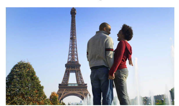
Paris airfares and crowding tend to drop at summer's end.

My husband and I would like to visit Paris this summer. Is it too late to get good airfare and accommodation deals? Will the Olympics in London in July wreak havoc on our plans? Would it be better to wait until the fall?