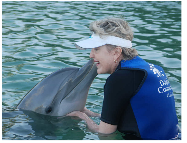
Hawks Cay's Dolphin Connection offers the opportunity to be kissed by a dolphin.

Natural beaches are few and far between in the Keys, but you won't feel water-deprived at Hawks Cay, with its gorgeous saltwater lagoon, five