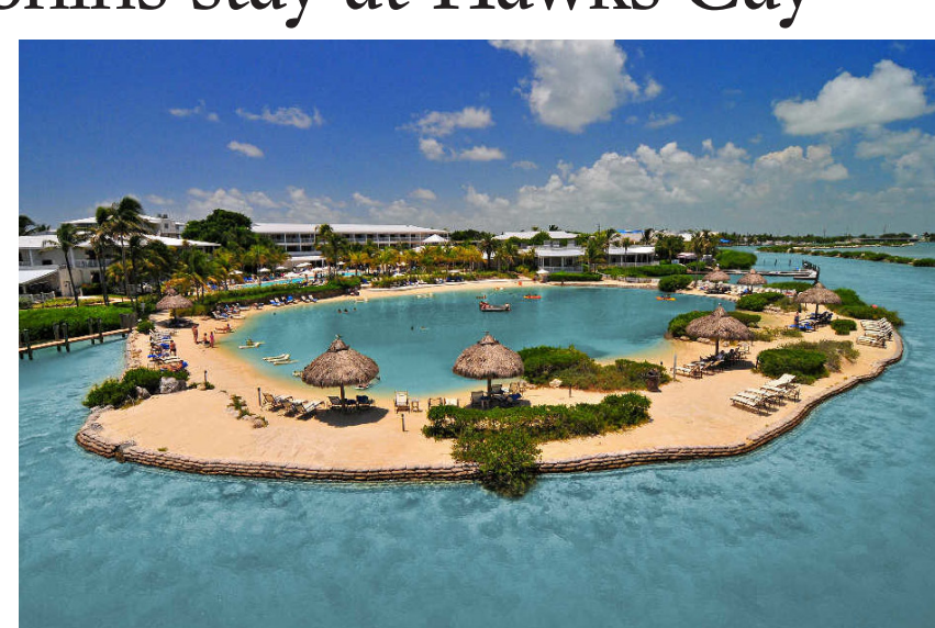
Hawks Cay Island Resort has five swimming pools, a saltwater lagoon and the open water beyond.

Besides enjoying time with the dolphins, guys who are ready to propose can arrange for the dolphins to help out. At the end of the couple's time with the dolphins, a trainer cues one of them to swim up to the prospective bride carrying a sign that says, "Will you marry him?" A box containing the ring is then pro-