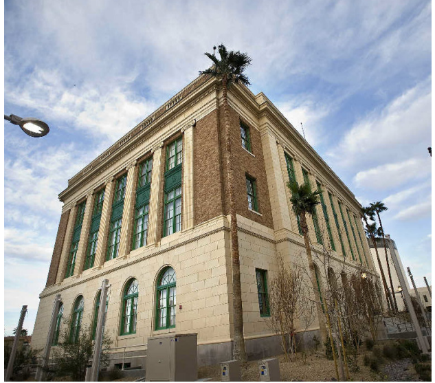
The National Museum of Organized Crime & Law Enforcement, in downtown Las Vegas, is better known as the Mob Museum.