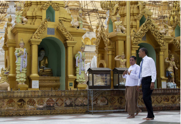
President Barack Obama's visit to Myanmar in November helped draw attention to this destination "off the beaten path."