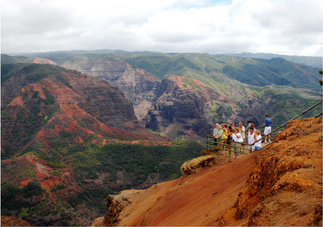
Waimea Canyon is often called the Grand Canyon of the Pacific, for obvious reasons.