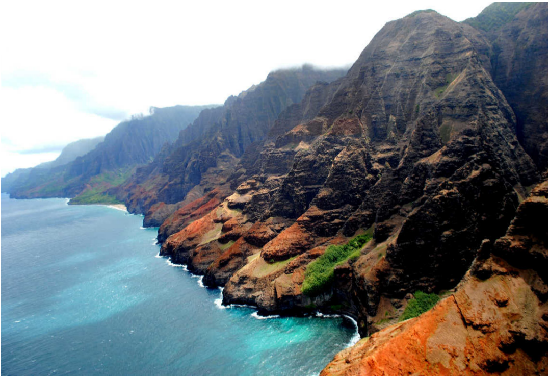
These jagged cliffs give the Na Pali Coast its name.