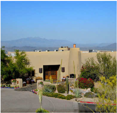
CopperWynd is near Scottsdale, Ariz. CopperWynd Resort and Club

CopperWynd Resort and Club in Fountain Hills, Ariz., just outside Scottsdale, offers the perfect pampering, relaxing escape for expecting moms. The luxurious resort, known for its breathtaking views of the mountains, has a "Baby-moon" package that includes a deluxe guest room with gas fireplace, a 50-minute maternity massage for the mom-to-be, a breakfast basket for two, a $100 food and beverage credit at the resort's Alchemy Restaurant, chocolate-covered strawberries and sparkling cider, and a late check-out. Rates start at $399 per night, plus tax, Tuesdays-Saturdays. The offer is valid through Jan. 31. 877-707-7760; copperwynd.com.