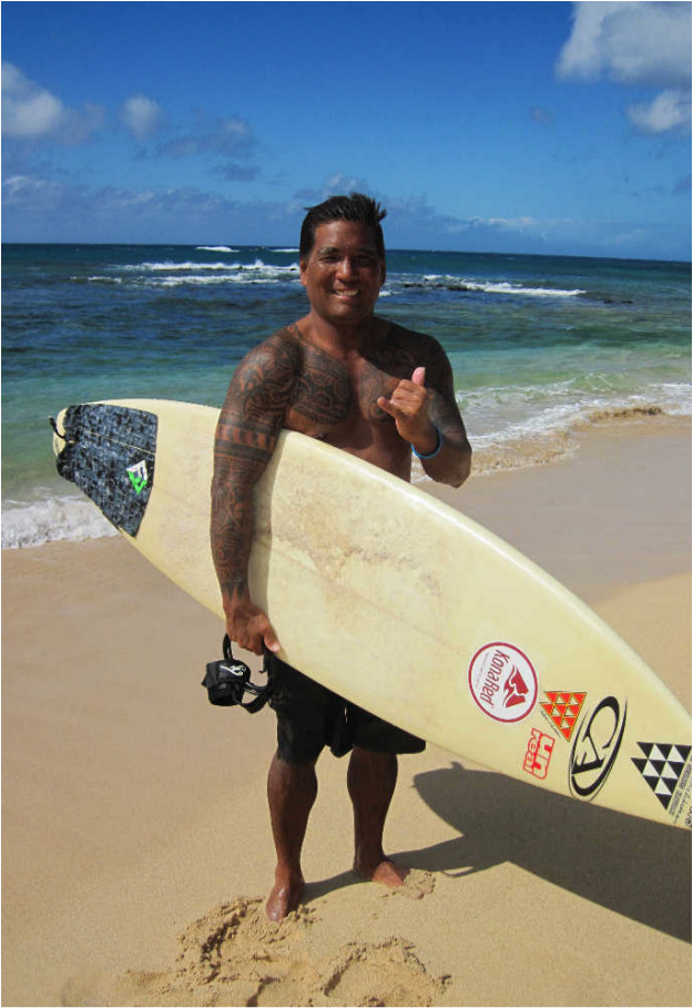
For surfers, Ko'a Kea Hotel & Resort fronts Poipu Beach.