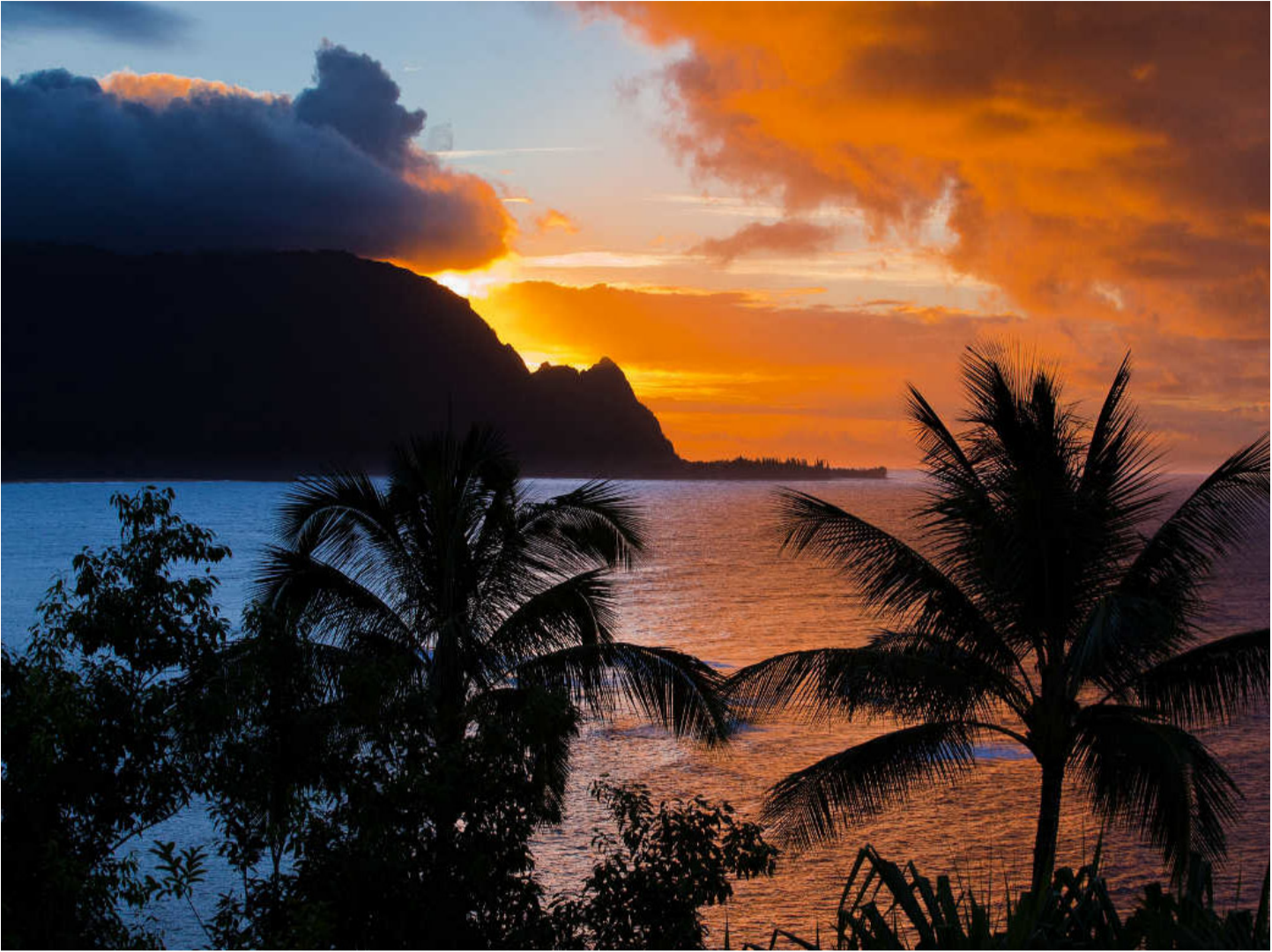
Mount Makana was featured as Bali Hai in the 1958 film adaptation of South Pacific .