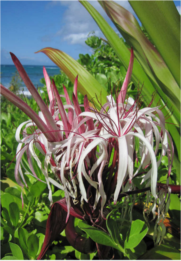
The Queen Emma giant spider lily is one of many examples of the Garden Island’s tropical flora.

We crossed the historic one-lane bridge into Hanalei Town, where we