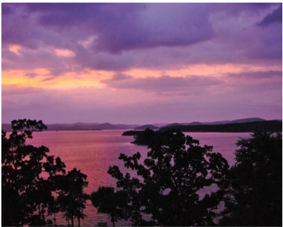
Hike near Broken Bow Lake in Oklahoma.

If hiking's more your thing than partying is, you might want to see 2013 arrive in a state park. On Jan. 1, free guided hikes will be offered in Texas, including at Bonham State Park, about an hour northeast of Dallas; Ray Roberts Lake State Park in Pilot Point; and Lake Whitney State Park, west of Hillsboro. See the complete list at bit.ly/WIGnln. Oklahoma will participate as well, at its state parks. Check out those locations at travelok.com/State_Parks.