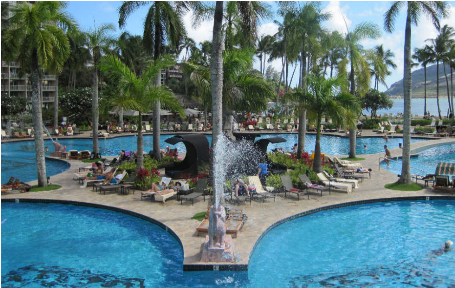
The pool at the Kauai Marriott Resort is the largest single-level pool in Hawaii.

Since Kauai caters to all types of visitors, my husband and I decided to experience four very different accommodation choices during our time there, covering different parts of the island.