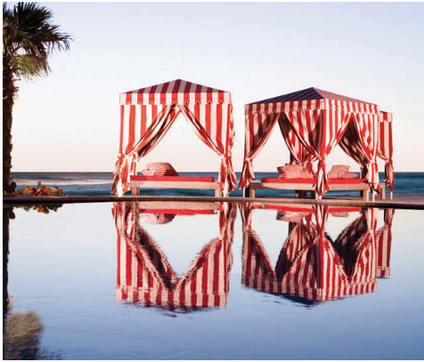
Poolside cabanas await at The Shores. Shores Resort & Spa