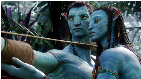
The characters of Jake and Neytiri in Avatar .