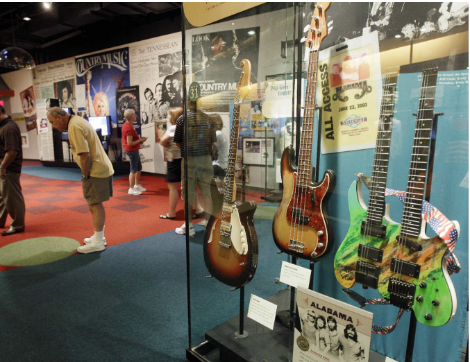
While at the music and arts festival, visitors can also check out exhibits at the Country Music Hall of Fame and Museum.