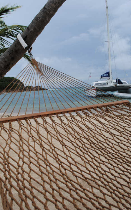
Make time for "limin' " in the hammock at Bolongo Bay.