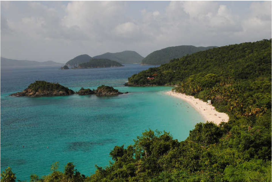
Trunk Bay Beach on St. John is known for its underwater snorkeling trail.

Passenger ferries operate between St. Thomas and St. John every hour from Red Hook, on the east end, and from Charlotte Amalie. Car barge service is also available for those who have rented a car on