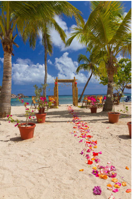
St. Thomas has become one of the most hassle-free Caribbean wedding destinations.