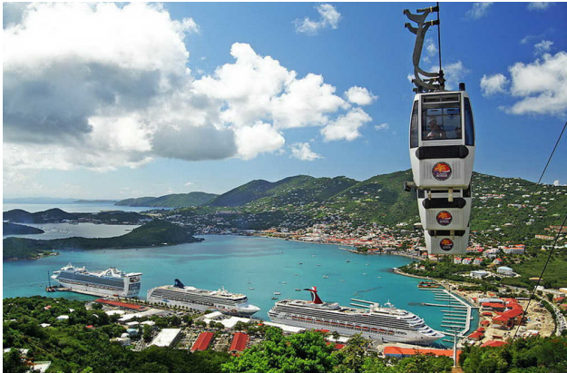
Trams make the 7-minute, 700-foot ascent to the top of Flag Hill's Paradise Point on the St. Thomas Skyride, where tourists can take in views of Charlotte Amalie's harbor.