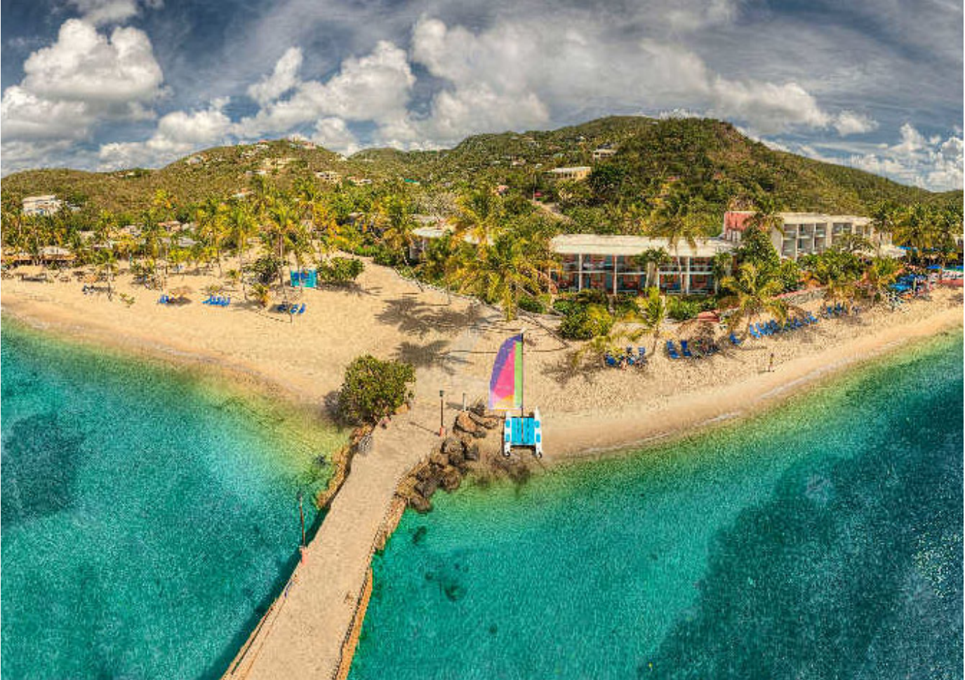
Bolongo Bay Beach Resort is on the island of St. Thomas, a popular destination in the Caribbean.