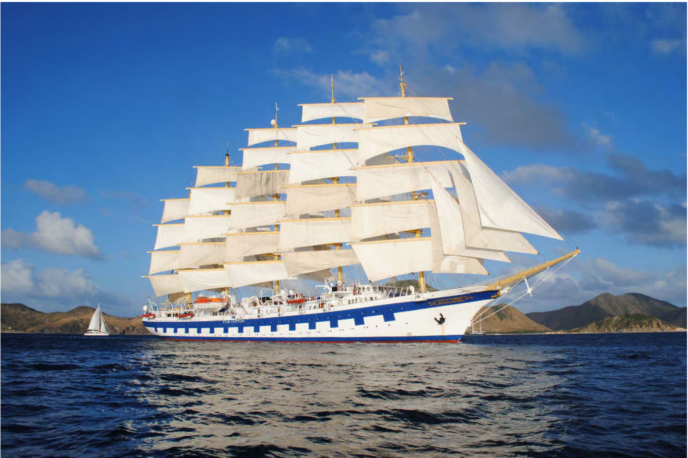
The Royal Clipper is the largest and only five-masted full-rigged sailing ship in the world.

Looking for a new kind of boat excursion? Here's ShermansTravel.com 's list of the best places to take a riverboat cruise. 1. Amazon River 2. Danube River 3. Hudson River and St. Lawrence Seaway 4. Mekong River 5. Mississippi River 6. Murray River 7. Nile River 8. Seine River 9. Volga River and Russian waterways 10. Yangtze River — Houston Chronicle