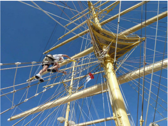
Throughout the week, passengers are given the opportunity to climb up to one of the crow's-nest lookout stations for an unbelievable view.

Passengers prone to seasickness should come prepared with medication for motion sickness — a patch or wristband — and be aware that the first and last nights at sea, those with the longest passage, are usually the rock-