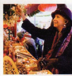
Shop for handmade crafts