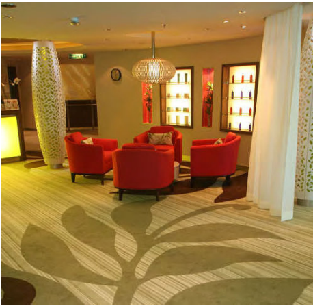
The spa entrance on the Celebrity Eclipse