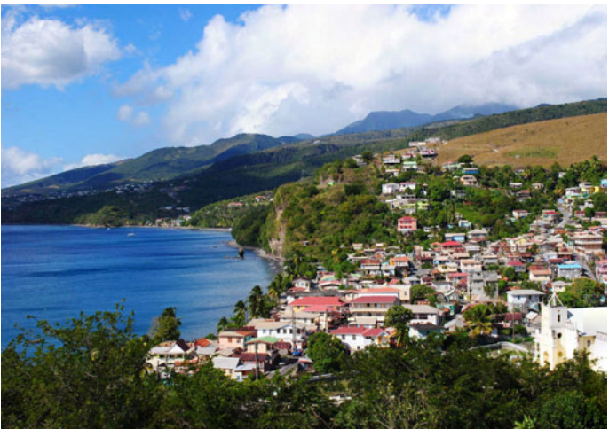
Dominica is lush, mountainous and unspoiled.