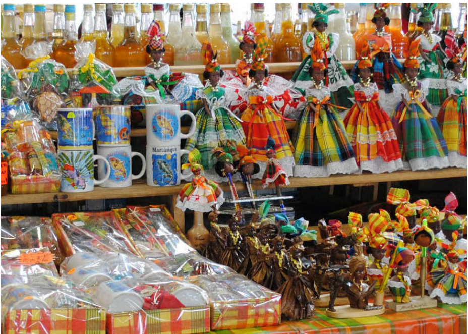
Vendor displays at the spice market in Fort-de-France include handcrafted dolls dressed in native plaid dresses.