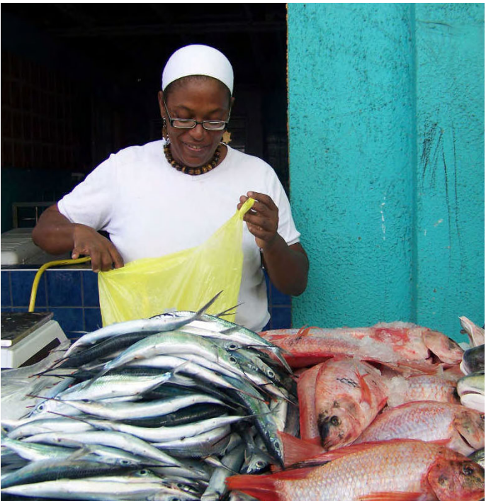
Needlefish and snapper are among the day's catch at the fish market along the River Madam in Fort-de-France.