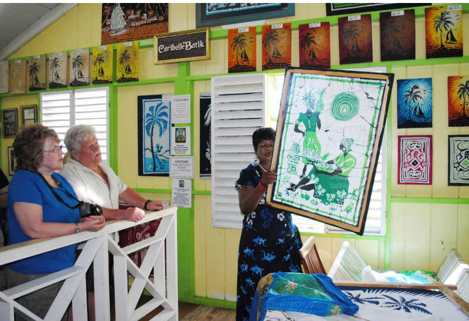
Visitors learn the process of making batik fabrics at the Caribelle Batik factory in St. Kitts.

Lush, unspoiled, and largely covered by rain forest, Dominica (Do-muh-NEEK-uh), known as "the Nature Island," was our second port of call. My friend and I chose an excursion to Trafalgar Falls, twin waterfalls in the midst of the forest, followed by snorkeling at