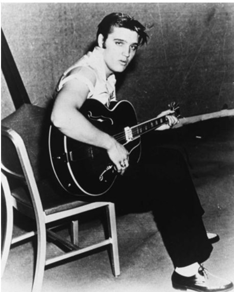
Elvis circa 1956 is the focus of an art contest.

Just in time for International Spa Week this week, Celebrity Cruises is offering special onboard spa package deals. The deals, in partnership with Elemis Spa, include: ■ Facial rejuvenation package, which includes a Botox treatment for crow's feet, an oxydermy facial, brow sculpting and a skin assessment, for $449 (usually $564) ■ Detox and body package, which includes a full-body seaweed massage, use of a thermal suite (like a sauna) for seven days, Pilates, yoga and a body composition analysis, for $245 (usually $417). ■ Pain management package, which includes three acupuncture treatments, use of the thermal suite for seven days and an herbal consultation, for $399 (usually $634). The deals are good through the end of the year. www.celebritycruises.com (click on "specials").