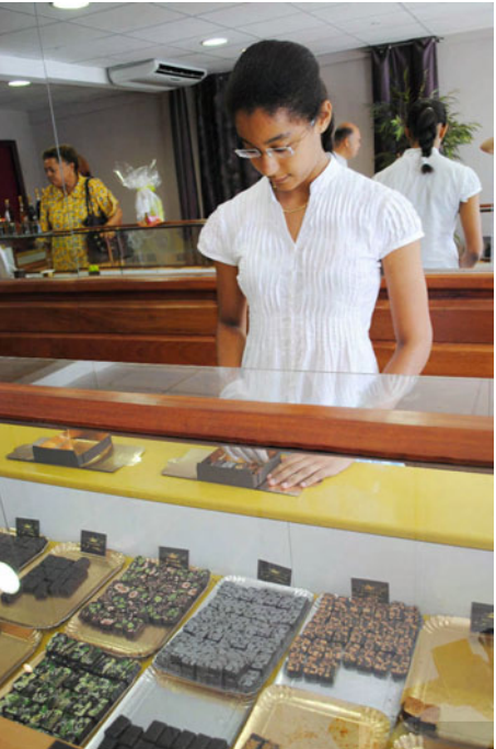
High-quality chocolates in more than 30 flavors are overlaid with artistic designs at Frères Lauzèa.