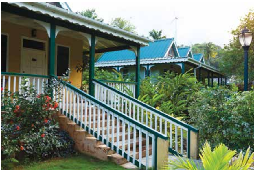
ROSALIE BAY RESORT

* AAA Prescription Savings is not insurance. Discounts are only available from participating pharmacies.