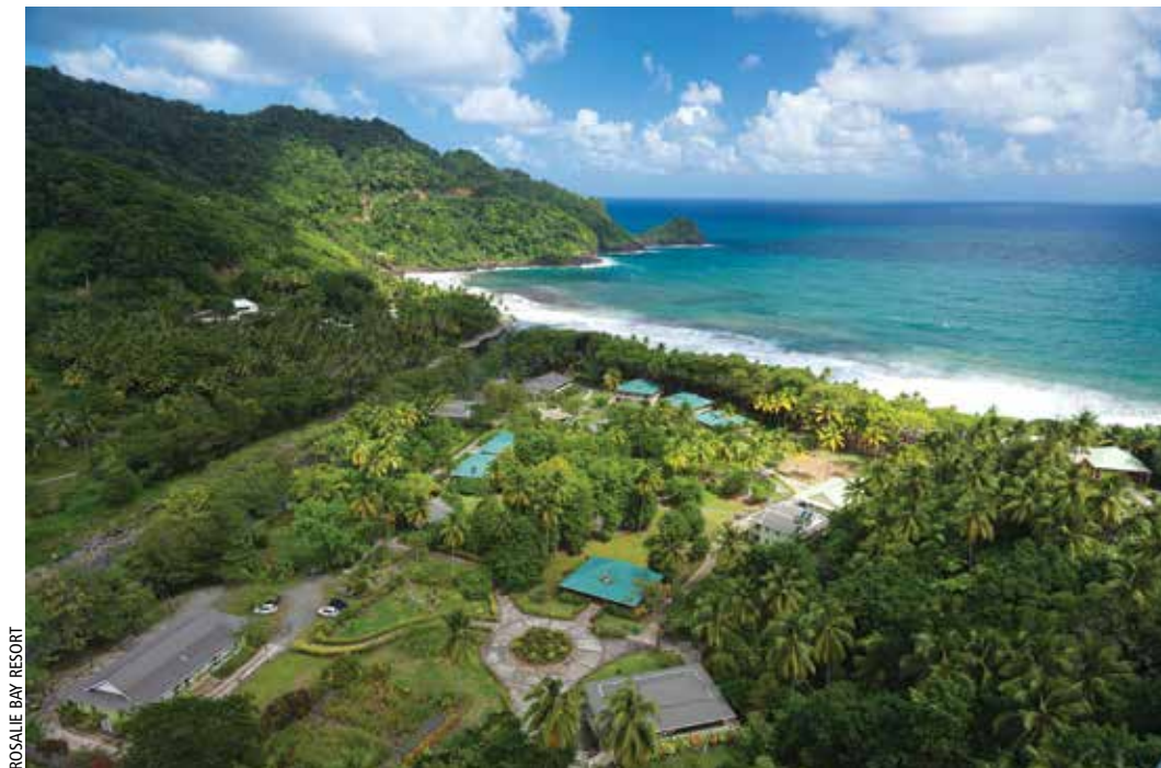
ROSALIE BAY RESORT

a Dominican native, could design and build a beachfront resort. They wanted to create a place of tranquility and wellness, and they wanted it to be eco-friendly in every way possible.