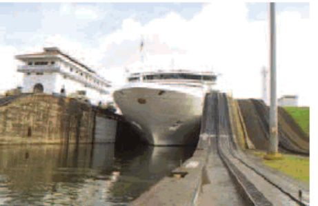
The new Panama Canal

For further information or to book any cruise or tour – call the Cruise & Travel Specialists at PaulsCruises.com. In Hurst – call 817-589-7447 or visit them at 941 Melbourne (just se of NE Mall –in the Subway Shopping Strip).