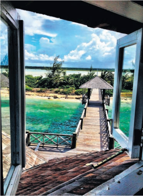
Rent a villa on Kamalame Cay. Kamalame Cay