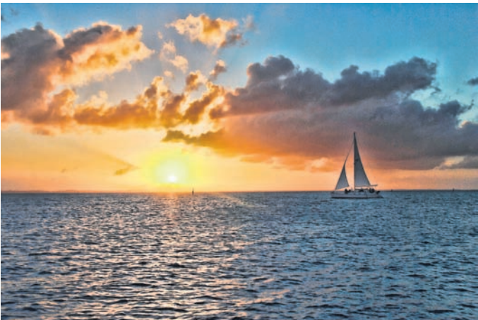
The day ends spectacularly on the water in Providenciales.

PROVIDENCIALES, Turks and Caicos — Twenty years had passed since my toes had touched the powdery, talcum-soft sand on Grace Bay. Time hadn't changed the intensity of the calm turquoise waters, sheltered by the coral reef located a half-mile offshore, but my surroundings at Ocean Club West, a 68-unit all-suite beachfront property, were decidedly different from the livelier, party atmosphere of Club Med, the all-inclusive resort where I'd stayed in the early '90s. It's more serene here, grown-up — ideal as either a quiet couples or family-centered retreat, and very accessible from Dallas-Fort Worth, with weekly direct flights on American Airlines.