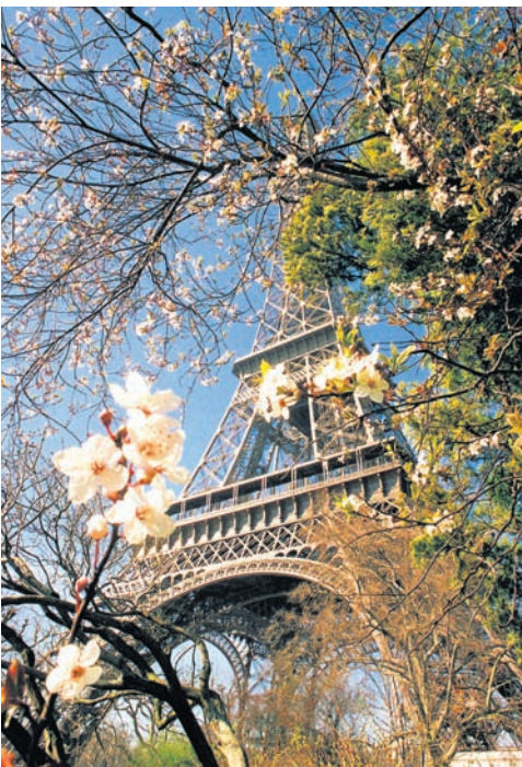
Paris is especially lovely in the spring.

Kamalame Cay, a private island hideaway in the Bahamas, has a March promotion for those who like their beach retreat heavy on luxury and seclusion. During March, Silver Top and Magnolia, two of its three-bedroom luxury villas, will be discounted 40 percent, to $1,510 per night, in a package deal that is specially tailored for families or groups of couples. The deal includes free breakfast, a high-speed boat trip to a remote white-sand island, and a picnic lunch and guided snorkeling trip for six, including transportation and equipment. Conditions include a minimum five-day stay, and up to six people per villa. Other activities and services include eco tours, sea kayaking, deep-sea and bone fishing and the Overwater Spa at Kamalame. 800-790-7971; www.kamalame.com