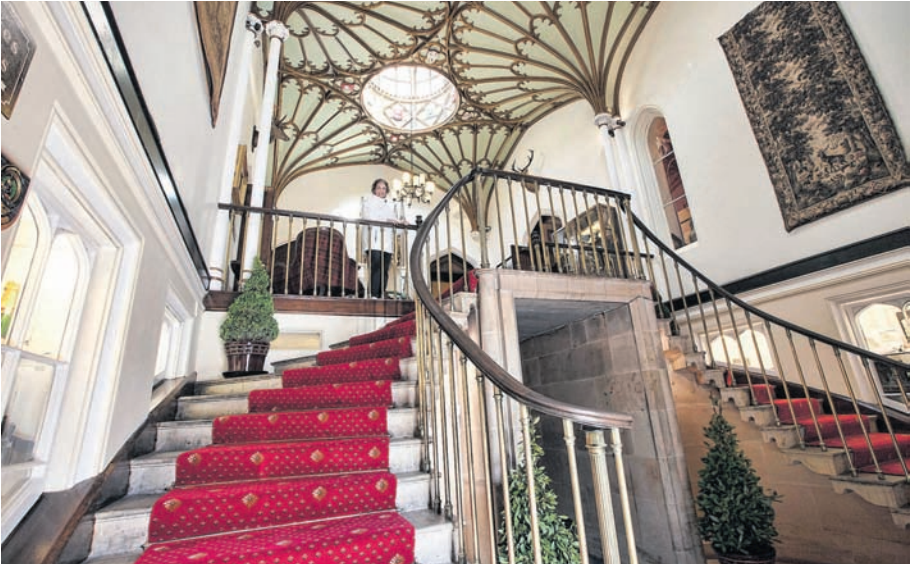
Dalhousie Castle dates to the 13th century.

In Scotland, there are essentially two ways to be able to spend a night in a castle: be part of royalty (either through birth or marriage), or buy your way in. Not having the ancestral advantage to accomplish the former, I chose the latter. I had spent 10 days sightseeing in Scotland, and my traveling companion and I had logged several miles each day touring the magnificent gardens and grounds of its finer castles. We'd ventured inside whenever possible, but some castles offer limited indoor access because they are residences to some of Scotland's and England's royals. These intriguing glimpses of castle life heightened the appeal of spending the night inside an ancient fortress, and we knew we didn't want to leave the country without parking our heads on pillows in a grand palace with a notable past. We set our sights on Dalhousie Castle, an imposing structure dating to the 13th century. It isn't as large as some of the royal castles we had visited, but its walls have housed an impressive amount of history and scandal. As the private residence of the noted Ramsay clan for eight centuries and the former seat of the Earls of Dalhousie, it was converted into a hotel in the early 1970s. Dalhousie's prime location in Bonny-