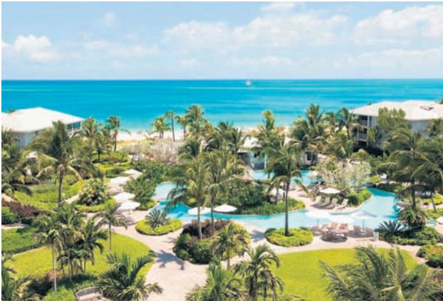
Ocean Club West is closer to shops, including a grocery store.

Later, at Da Conch Shack and Rum Bar on Blue Hills Beach, my challenge of the day was choosing between the wild variety of ways this local delicacy is prepared, including my personal favorite: marinated conch salad.