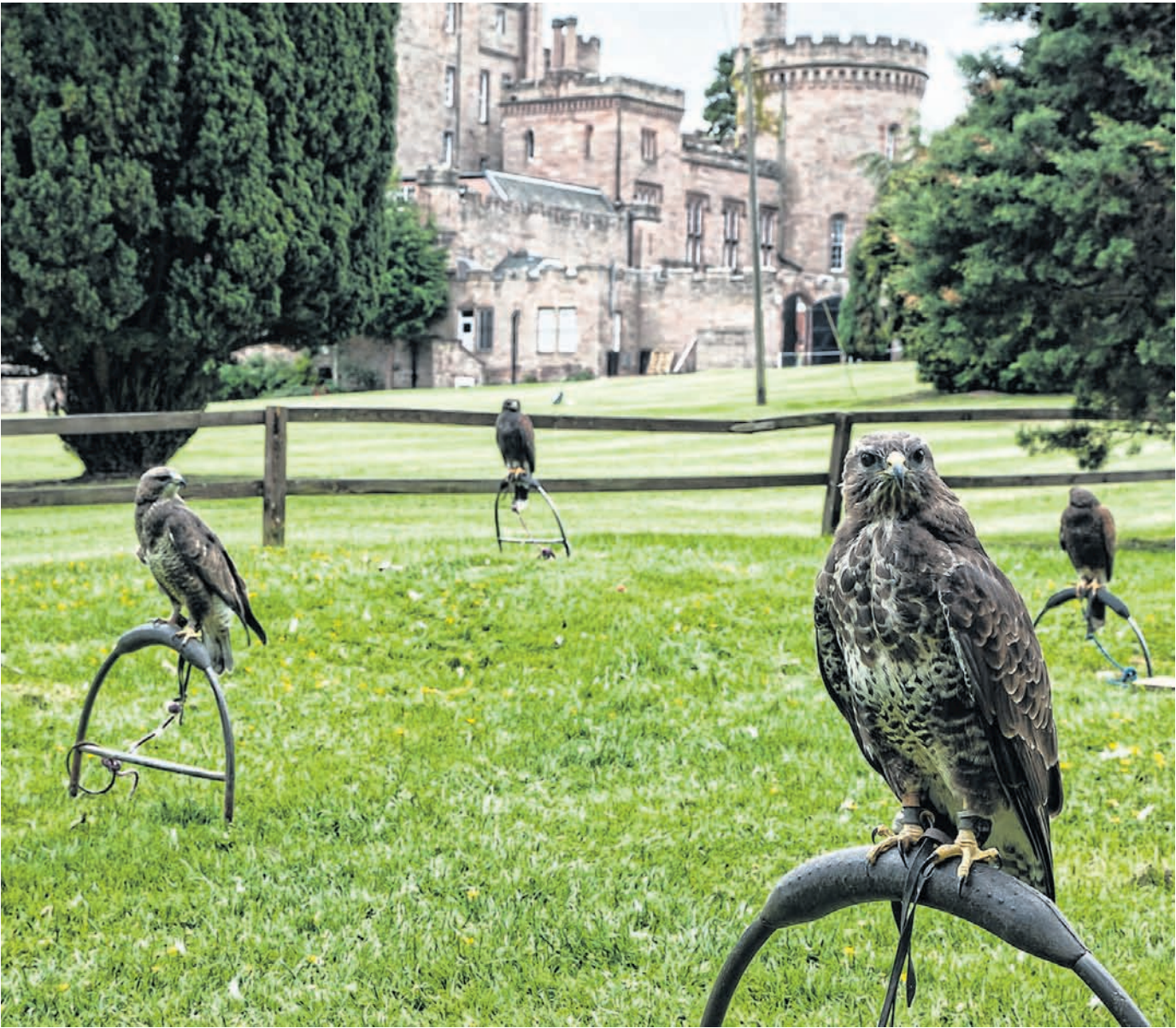
Dalhousie Castle is known for its falconry program and has some 65 birds, from owls to eagles.