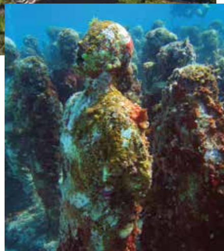
DEBBRA DUNNING BROUILLETTE

Grand Residences Riviera Cancun (above) offers luxury amenities, including adult and family pools. Hundreds of life-size sculptures, submerged in 10 to 28 feet of water, comprise Cancun's Underwater Museum of Art (right).